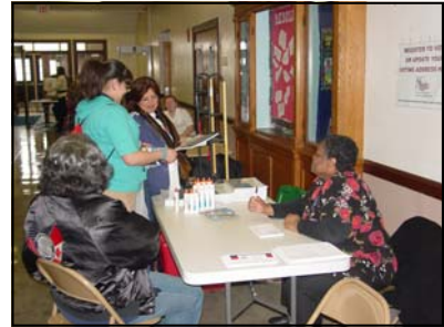
Volunteers provided resources to parents and students at Central Academy parent-teacher conferences.